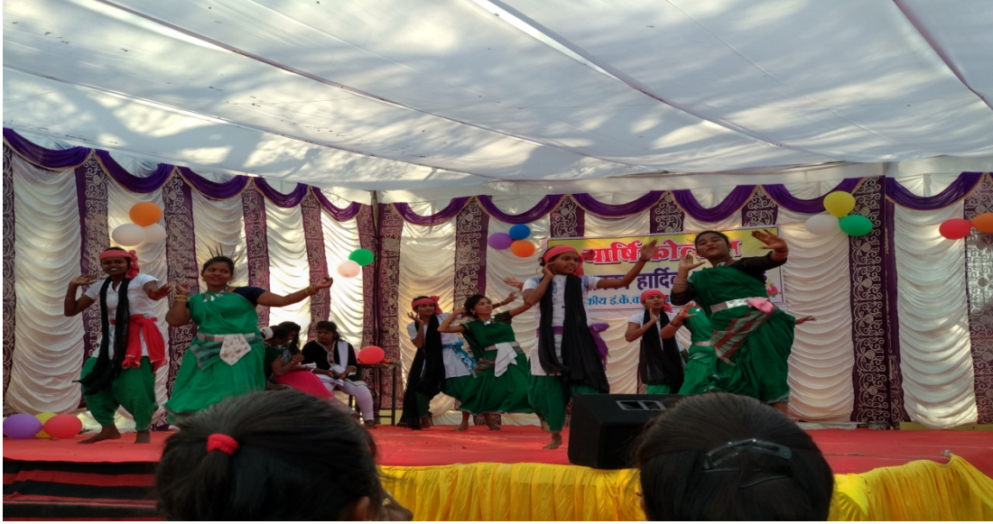
Cultural Activities 2017-18